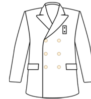
DOUBLE BREASTED DRESS COAT