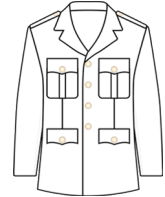
SINGLE BREASTED DRESS COAT