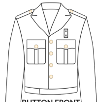
BUTTON FRONT IKE JACKET