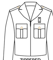
ZIPPERED IKE JACKET